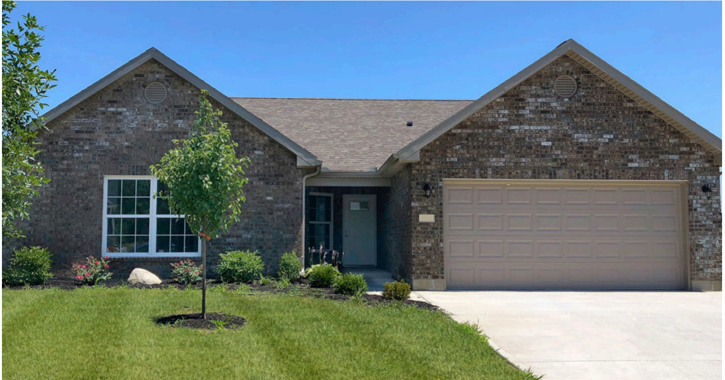
Photo is for marketing purposes only. Front elevation and exterior finishes subject to change.